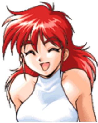
Misao Age 19

Curiosity compelled her to enter the Mansion many years ago -- and she's been trapped here ever since. A tomboy, she's often very silly. She is active and rebellious against authority.