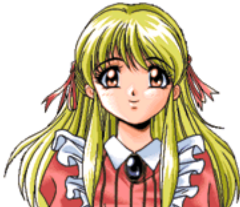
Arisa Age 19

He's a programmer for a large company in Tokyo. One night, while drinking in Shinjuku, he got wildly drunk, and when he awoke, he was here inside the Mansion. He loves alcohol more than anything.