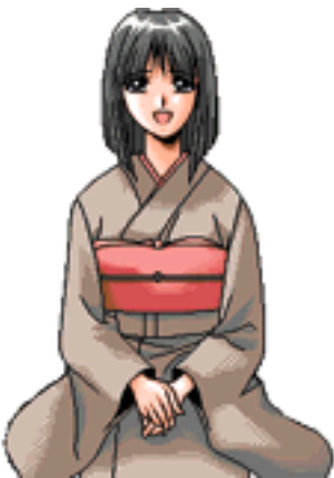
Yura Age 19

Curiosity compelled her to enter the Mansion many years ago -- and she's been trapped here ever since. A tomboy, she's often very silly. She is active and rebellious against authority.